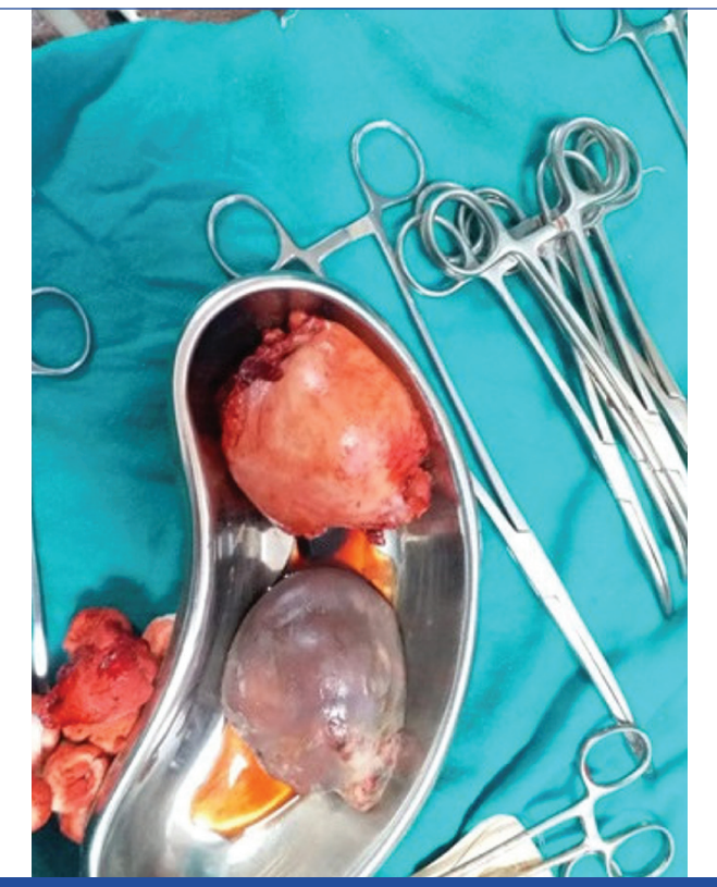
[Table/Fig-2]: Foetal head size of 18-20 weeks size which was lying in abdomen along with perforated uterus (Subtotal hysterectomy).